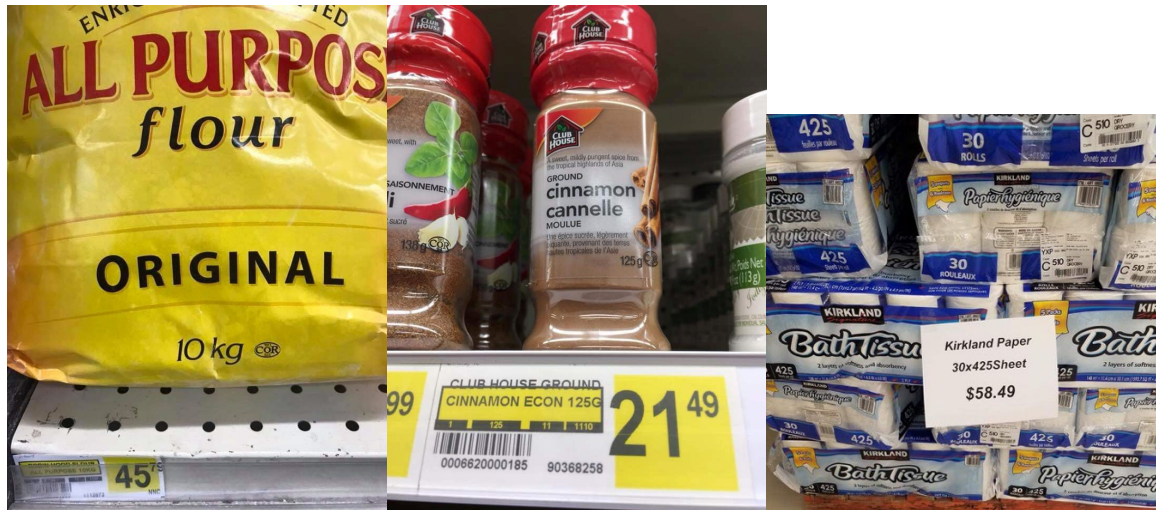
Some dated pictures of the cost of groceries in Canada's north.

Smaller communities with bigger hearts. This is one way to describe the communities and the congregations within the Council. Communities in the Council are communities in a true sense. This is a blessing from being remote and isolated. The next community may be a 5-hour drive away if the ferry or ice road are in service. People congregate and lookout for one another. The mission of the church takes on deep meaning and practice in these spaces with limited resources.